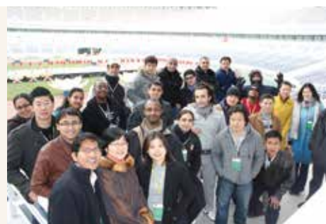
参观奥运场馆项目 Visit to Beijing Olympic arenas