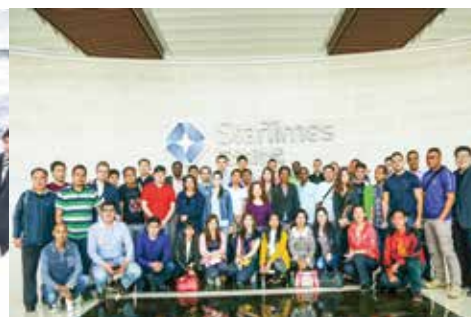
参观卫星数字电视项目 Visit to Satellite Digital TV Project