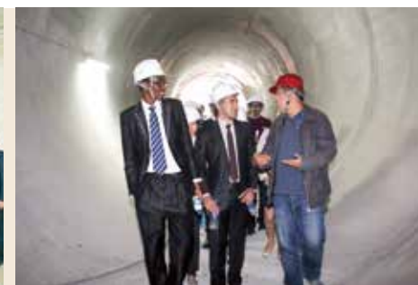
参观南水北调工程 Visit to South-to-North Water Diversion Project