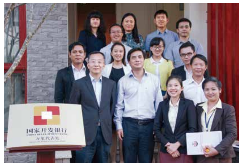
老挝留学生校友与国家开发银行代表在国家开发银行万象代表处合影 Photo of Laos Alumni and CDB Delegates in CDB Vientiane Representative Office