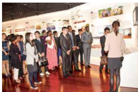
参观国家开发银行行史馆 Visit to CDB History Museum

Field trip: visiting projects and enterprises financed by CDB