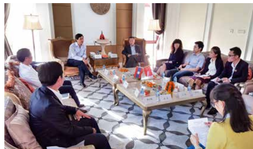
老挝留学生校友座谈会 Laos Alumni Meeting