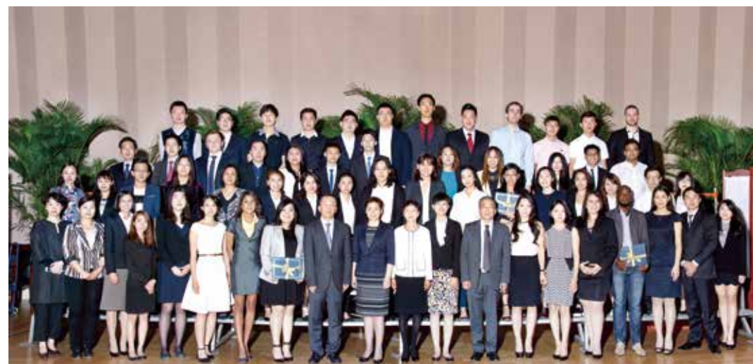
2015 年国家开发银行奖学金优秀留学生颁奖典礼 Award Ceremony for CDB “Excellence” Program Scholarship in 2015